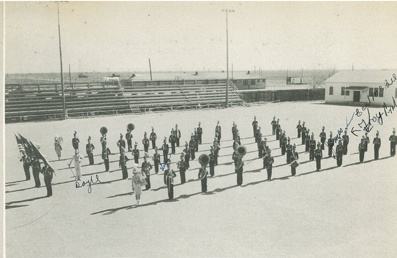
The Marching Band